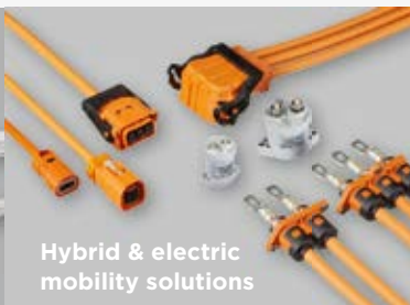
Hybrid & electric mobility solutions