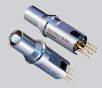
050-307 Radiation Tolerant