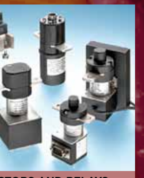
POWER CONTACTORS AND RELAYS