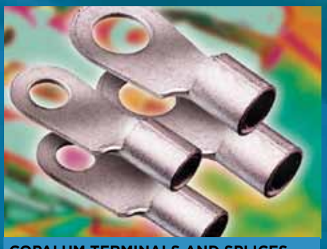
COPALUM TERMINALS AND SPLICES

COPALUM products are the proven way to achieve highreliability terminations of aluminum wire or splicing between copper and aluminum wires without the need for inhibitor agents to break down oxides.